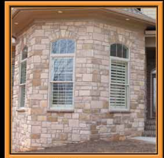
Limestone Natural Tan

Typically set in ashlar pattern, this soft-colored stone reflects the elegance and fine craftsmanship of classic architecture.