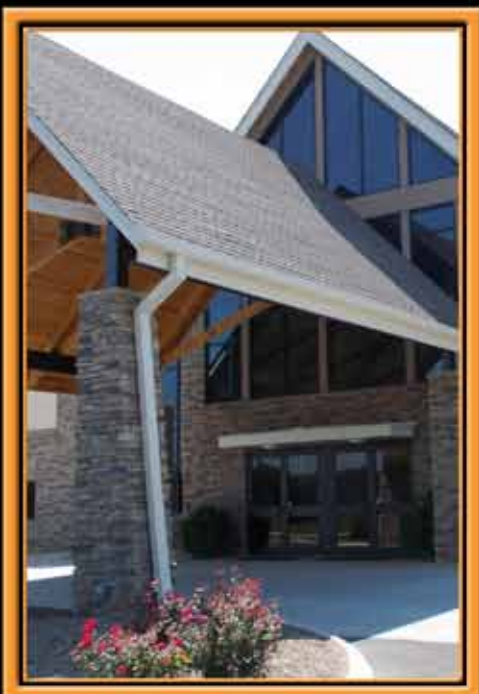
LedgeStone Highlands Brown