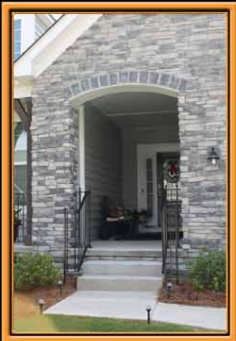
Stackstone Oklahoma Grey