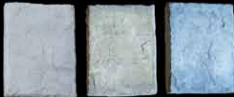
Trim Stone 6" x 8"