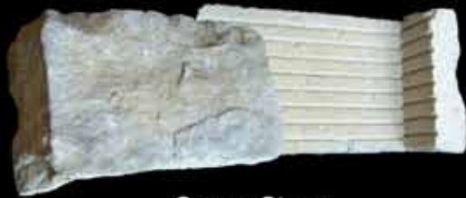
Corner Stone Available in all styles and colors