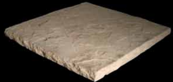
Hearthstone / Flat Wall Cap 19" x 20" 2" Thick