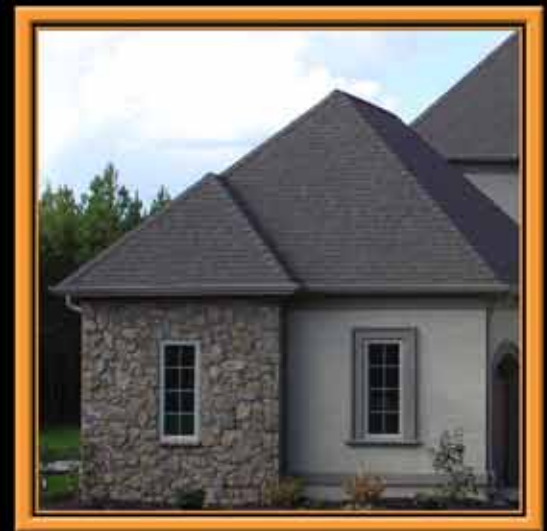
Fieldstone Mayan Cliff

The beauty of nature captured. Irregular shapes combined with a range of tones allow for infinite design possibilities.