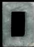
Receptacle 4.875" x 6.875" Opening 2.25" x 3.875"