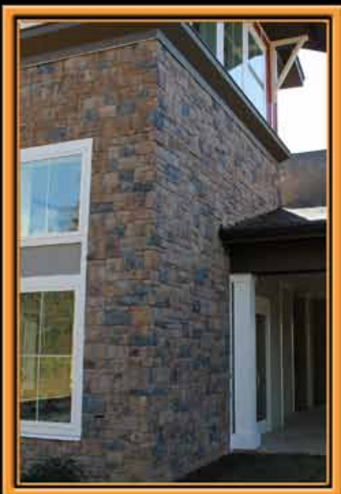
Split Face Castle Blend