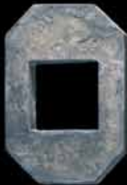
Light Box 7.5" x 11" Opening 4.25" x 4.25"