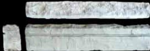
Sill Length 18" Depth 3.75" Thickness at base 2.375" Thickness at tip 2.125"