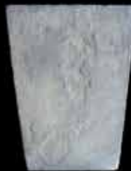
Keystone Height 9.75" Top 7.75" Bottom 5.5"