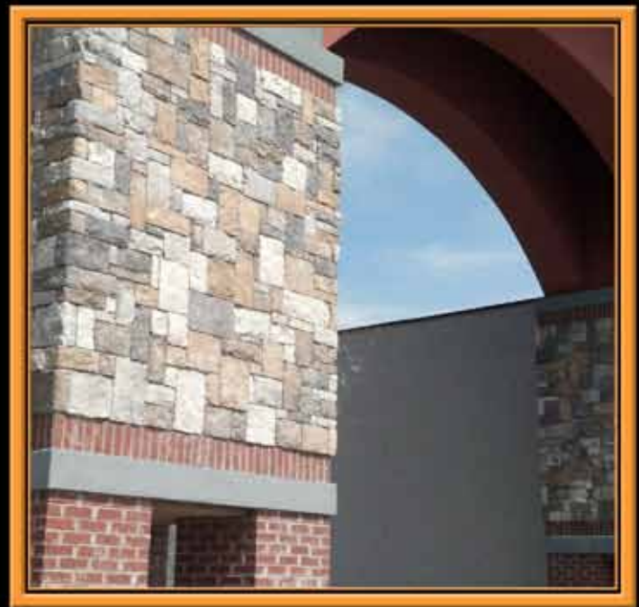
Split Face Piedmont

Inspired by Old World castle stone, this style creates enduring elegance and charm.