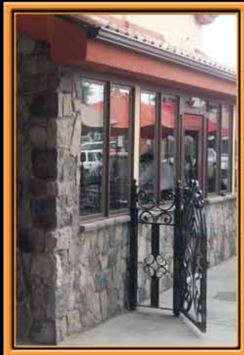
Fieldstone Custom Blend