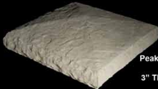
Peaked Column Cap 19" x 19" 3" Thick, 4" at Peak