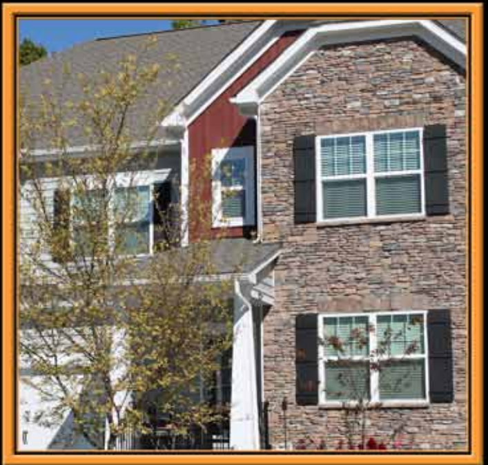
Southern Appalachian Ledgestone Smokey Mountain

This highly textured, rough-cut stone makes a bold statement and provides a strong, rugged appearance.