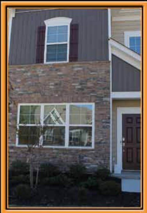
Southern Appalachian LedgeStone Smokey Mountain