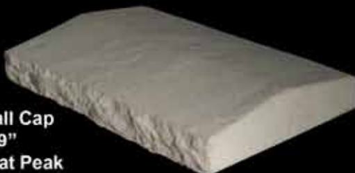
Beveled Wall Cap 12" x 19" 2" Thick, 3" at Peak