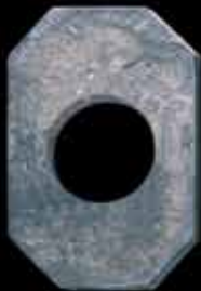
Light Box 7.5" x 11" Hole 4.125" Diameter